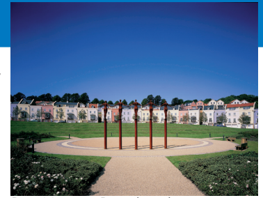
Port Marine, Portishead

Crest Nicholson, one of the UK's leading property developers, is using ITESOFT's processing solution, ITESOFT.FreeMind for Invoices, to help streamline data capture from invoices.