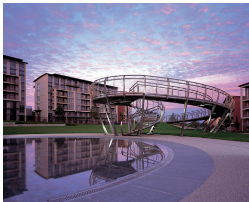
Park Central, Birmingham